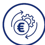
FINANCING FOR CHANGE