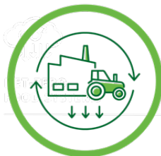
A NET ZERO FOOD SYSTEM