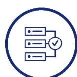
DATA, DEFINITIONS & STANDARDS